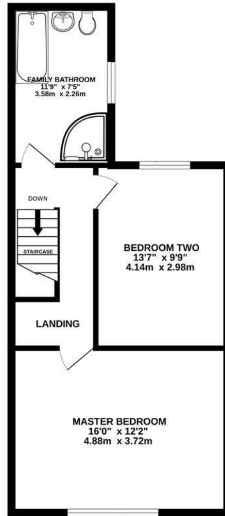
1ST FLOOR 500 sq.ft. (46.4 sq.m.) approx.